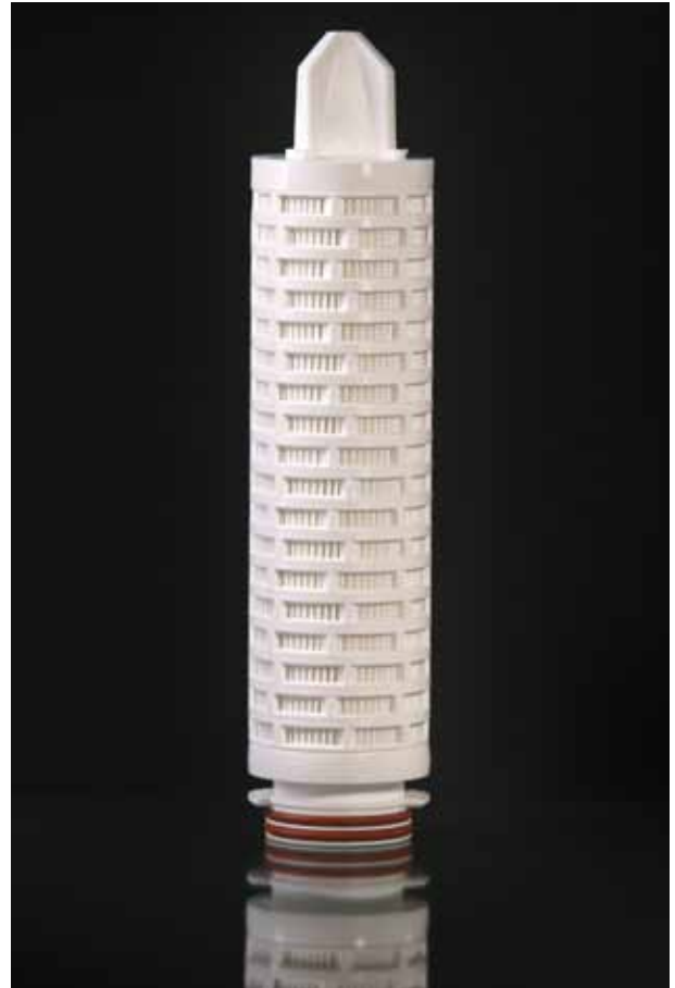
Note: PREPOR is a registered trademark of Parker domnick hunter