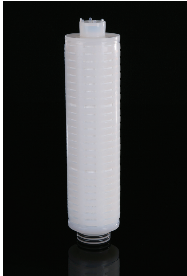
Note: TETPOR is a registered trademark of Parker Hannifin Corporation.