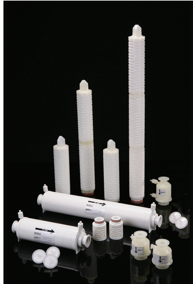
Note: PROCLEAR is a registered trademark of Parker Hannifin Corporation.