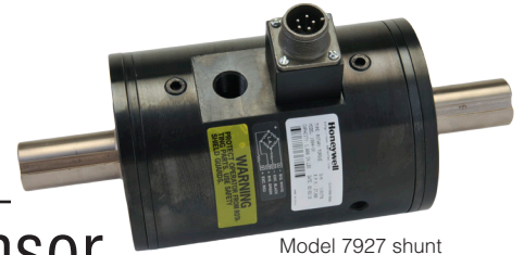
Model 7927 shunt cal reference box included with each purchase of 1800 Series.