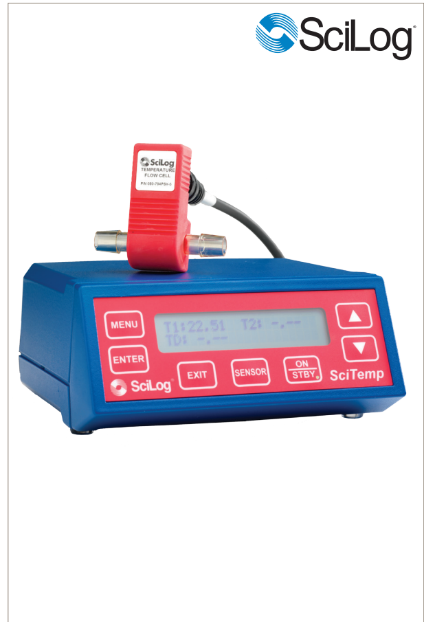
Note: SciTemp® is a registered trademark of Parker Hannifin Corporation.