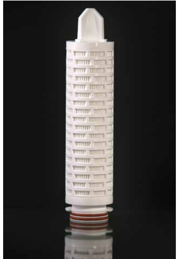
Note: PREPOR is a registered trademark of Parker Hannifin Corporation.