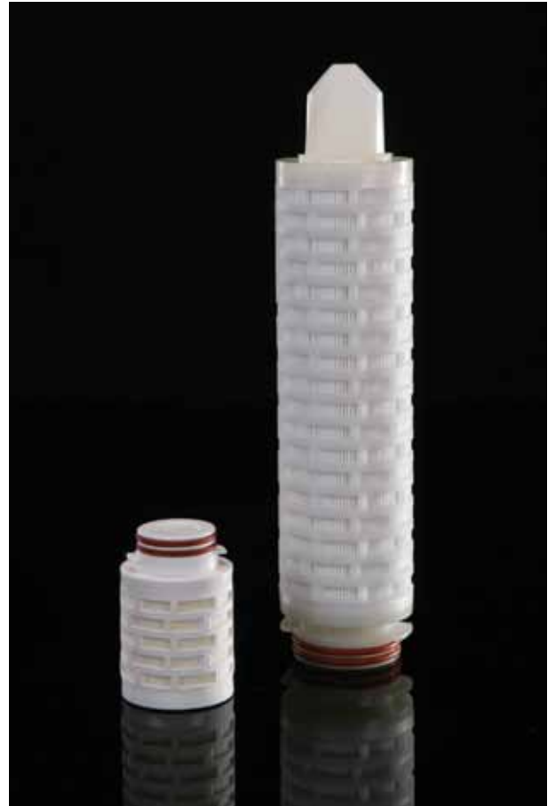
Note: BIO-X is a registered trademark of Parker domnick hunter