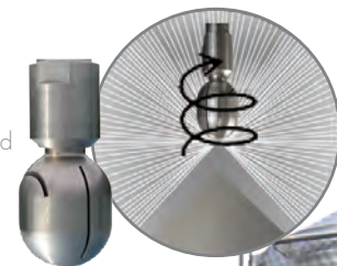
Rotary washing head

Usage of washing heads implies more profound cleaning of uneasily accessible inner parts.