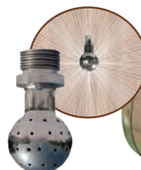
Static washing head

Usage of washing heads implies more profound cleaning of uneasily accessible inner parts.